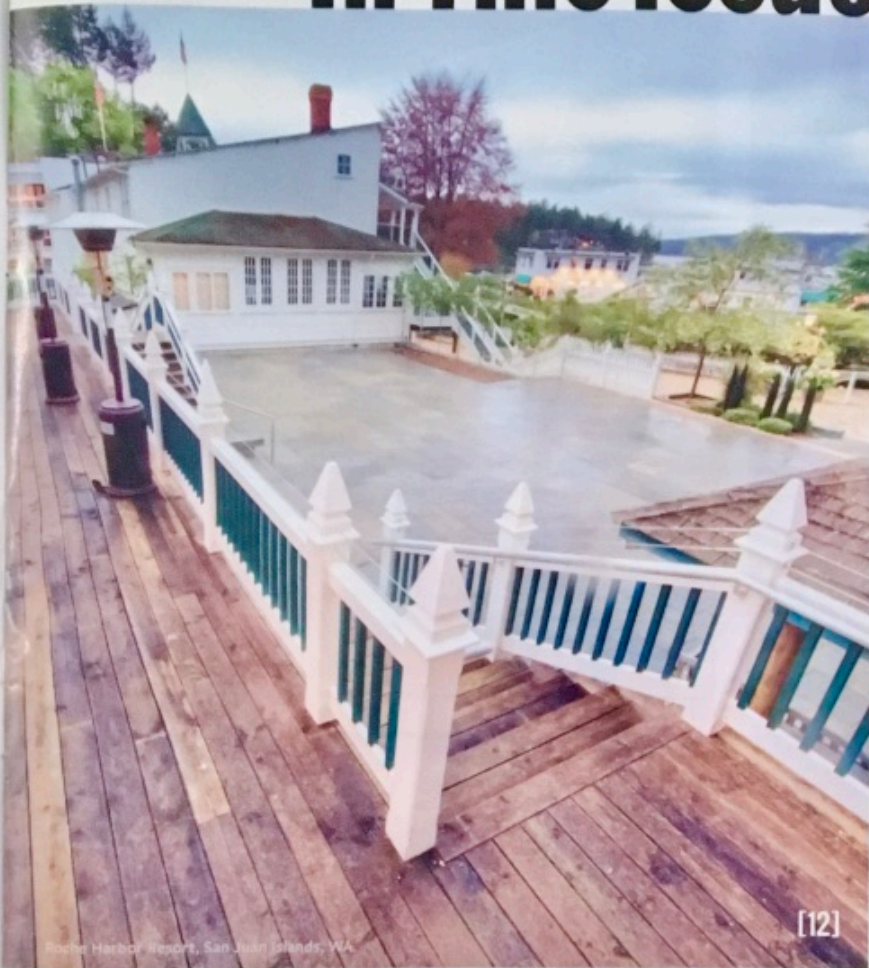
Roughly Harbor Resort, San Juan Islands, WA