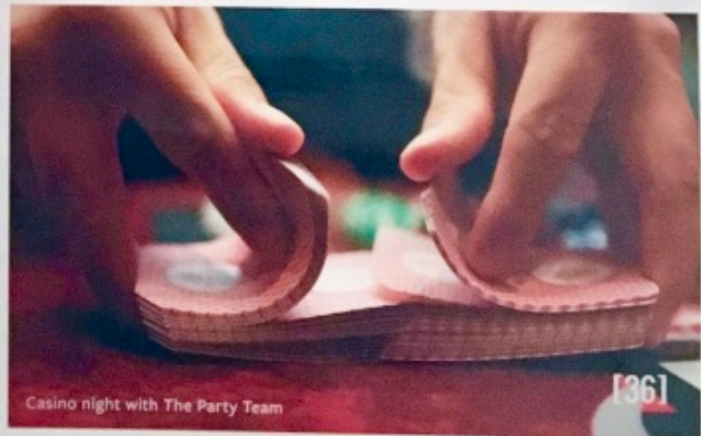
Casino night with The Party Team